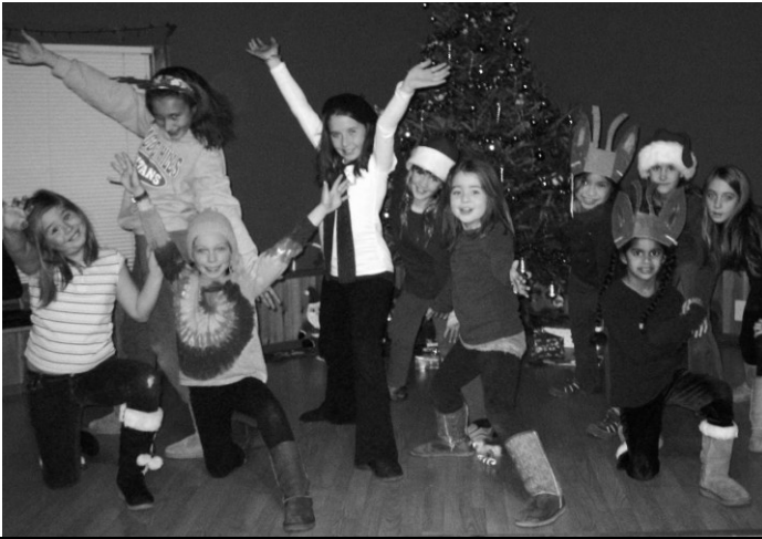
Local kids perform in the holiday musical they wrote. The Kids Holiday Theater Workshop, like all CAT events, are free for kids

Between Christmas and New Year’s Day, CAT presented its annual Kids Theater Workshop , which is free to local children, as part of the CAT Kids Holiday Spectacular in Copake. The Spectacular, which features youth participants performing their own musical piece, as well as variety acts and a play performed by local actors about Santa Claus, was a big hit. The play was presented again a few days later in Chatham.